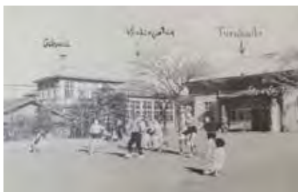
School in Omori, Tokyo

The school gained their own building when it was rebuilt in 1953, and then moved to Omori, Tokyo in 1967. The number of students increased as they moved back to Yokohama, which is where they stay to this day.