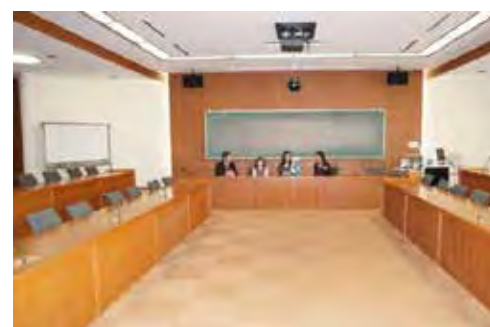
The Conference Room

Lectures are held in the conference rooms in English. There is a small both that allows for 2 interpreters to translate from English and Japanese. The International School Network is planning to hold a discussion meeting at this conference room on June 16 th , 2014. Please contact us if you are interested.