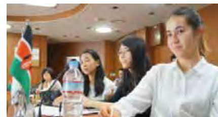
(Seisen International School)