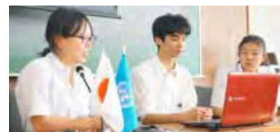
(Saint Maur International School)

There were four groups of presenters. The presenting groups from Yamate Gakuin, Yokohama Minato Sohgo Gakkou, and Saint Maur International School (Team B) made presentations about education. The second group from Saint Maur International School (Team A) presented about the convenience and beauty of cities and streets. All groups presented in English, and the presentations were well done.