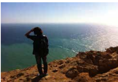
Cape Roca, Portugal

Students of International Schools say that their friends and families have many close connections to the world. Because I did not understand those feelings of switching cultures, I really wanted to go on a journey and check for myself in my own eyes and feel the differences. That was what made my move.