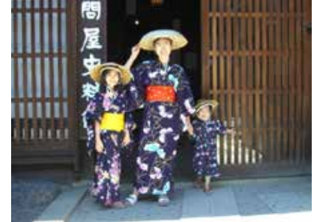
Off to a Journey

However, people with high statuses did not stay at ordinary inns. They stay at the best post stations in the best inns, called "Hon-jin", or stronghold. These were very popular with a large number of people, so booking was necessary. For reserving, letters called "Hikyaku", or express messenger, was used.